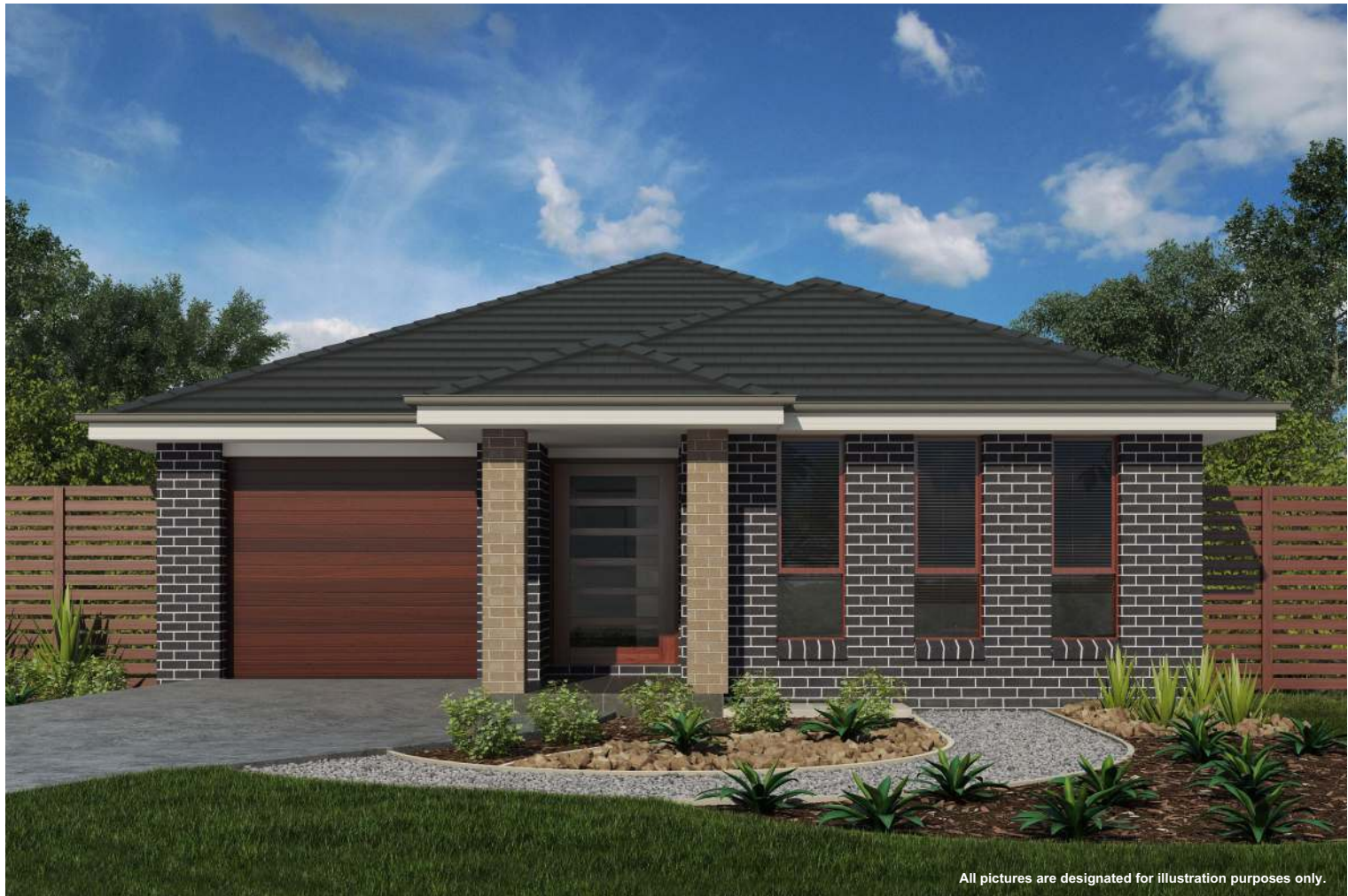
All pictures are designated for illustration purposes only.